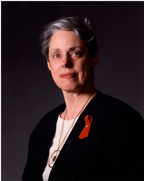
Official portrait, 2 nd Parliament of World's Religions, Chicago, 1993