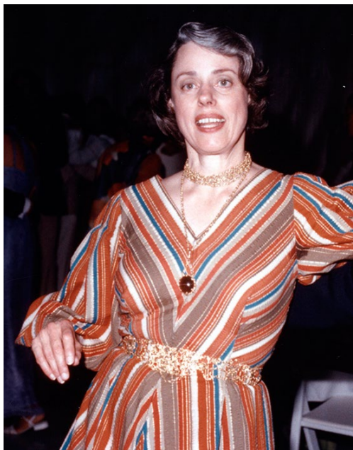
Dancing at Guild Hall's 50 th Anniversary Ball, East Hampton, 1981