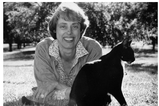
With Madam, on the lawn at Quail Hill, 1988