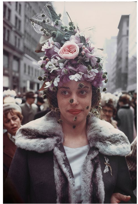
At the Easter Parade on Fifth Avenue, New York City, early 1960's