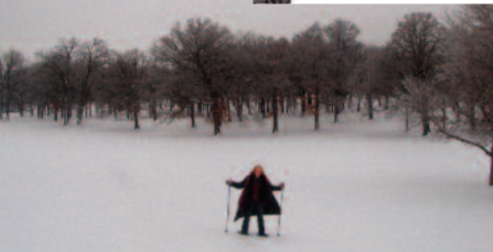
Biking, hiking, skiing & snow shoeing!