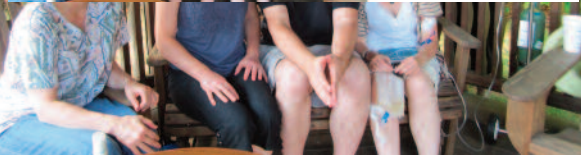
Hundreds of well wishes, cards and visitors adorned the Ziebler Hospice